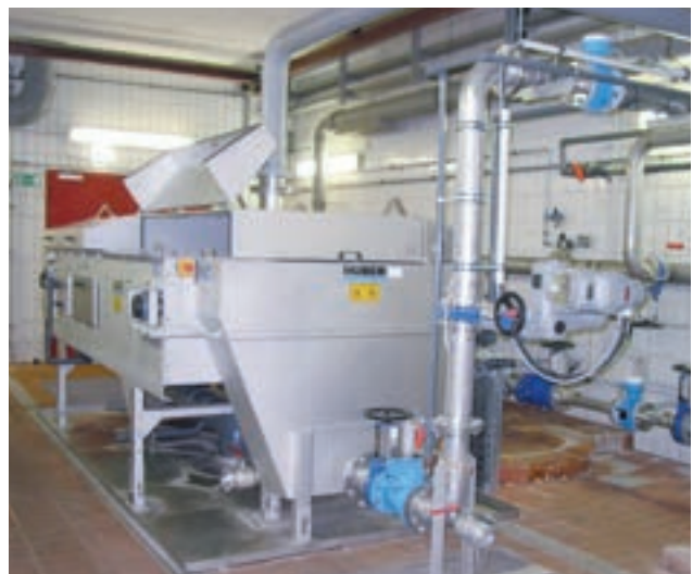
HUBER Belt Thickener DrainBelt for 60 m 3 thin sludge per hour.