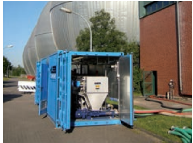
Mobile containerised demo unit.