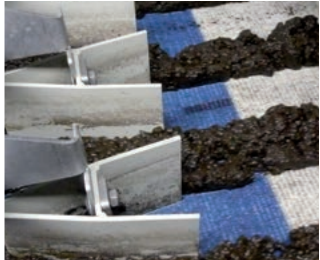
Chicanes furrow the sludge to facilitate drainage and support the production of a concentrated sludge cake.