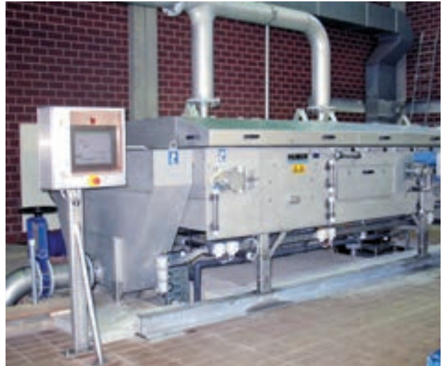
HUBER Belt Thickener DrainBelt for up to 100 m 3 /h thin sludge.