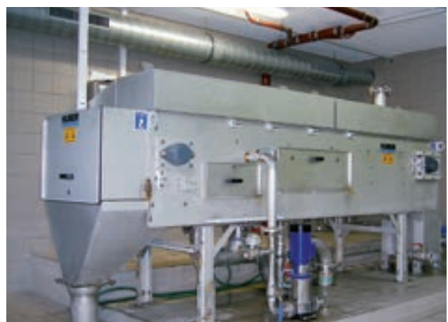
Belt washing with filtrate water as spray water.