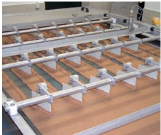
Thickening of dairy sludge.